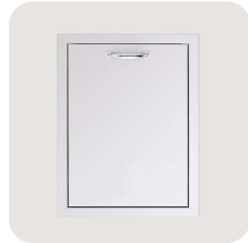
20" Trash Pullout Drawer