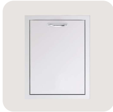
20" Trash & Recycling 2-Bin Pullout Drawer