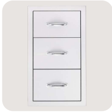
17" Triple Drawer