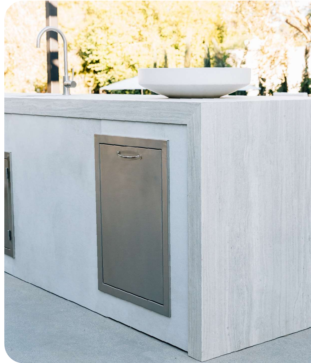
FEATURED: 20" TRASH PULLOUT DRAWER