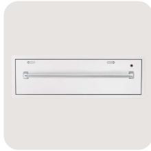
36" Warming Drawer