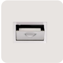
17" Paper Towel Holder