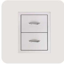
17" Double Drawer