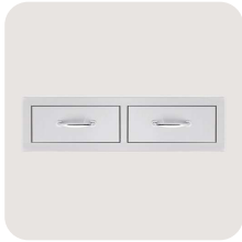
32" Double Horizontal Drawer