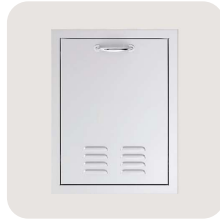
20" Vented Liquid Propane Tank Or Trash Drawer