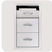
17" Vertical 2-Drawer & Paper Towel Holder Combo