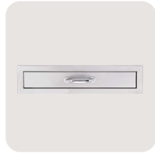
26" Utensil Drawer