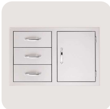
33" 3-Drawer & Access Door Combo