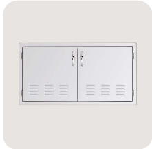
33" Vented Double Access Door

Our access doors give you elegant and convenient access to your island, utilities, and grill. Made with commercial grade stainless steel, heavy-duty flanges, reversible door mounting, and magnetic latches.