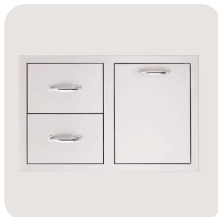
33" 2-Drawer & LP Tank Pullout Drawer Combo