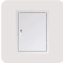
Vertical Access Door (16", 18", 20")

SSDD-26 / SSDD-30 / SSDD-33 SSDD-36 / SSDD-39 / SSDD-42 SSDD-45