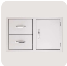
2-Drawer & Access Door Combo (30", 33", 36", 42")

These components are specifically designed with versatility in mind. Whether you need a simple storage setup, LP tank drawer, paper towel holder, or weather-resistant dry storage shelving, these commercial grade stainless steel combos give you the options you need for a perfect outdoor setup.