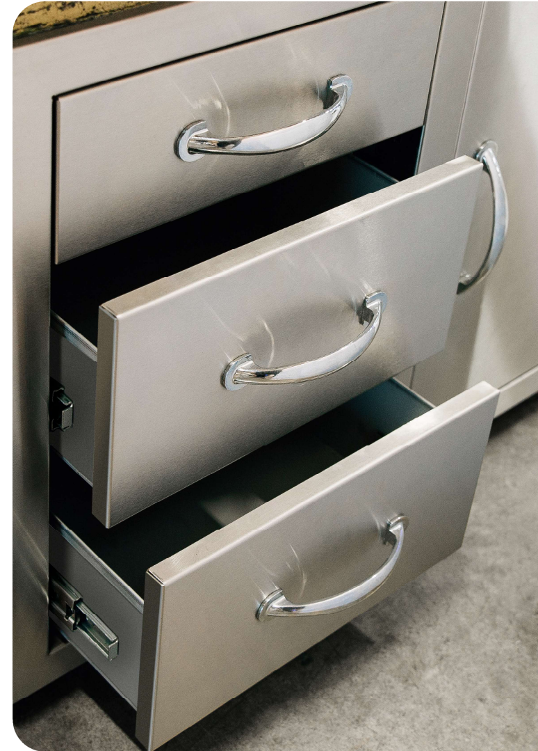
FEATURED: 33" 3-DRAWER & ACCESS DOOR COMBO