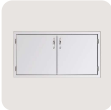
Double Access Door (26", 30", 33", 36", 39", 42", 45")

SSDD-26 / SSDD-30 / SSDD-33 SSDD-36 / SSDD-39 / SSDD-42 SSDD-45